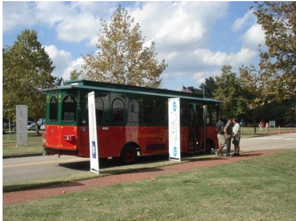
Figure 1. Williamsburg Trolley at the recent Occasion for the Arts on Boundary Street